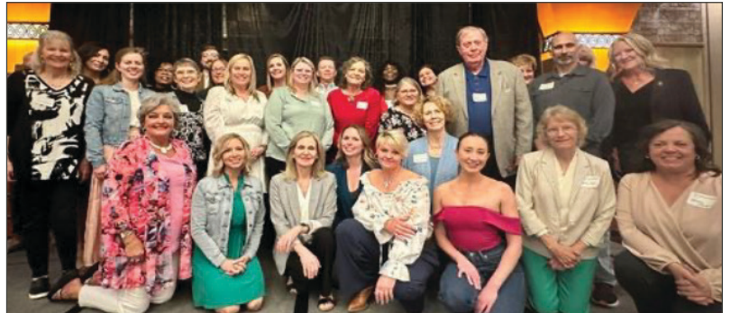
Check out this great-looking group of people: CASA's mighty Volunteer Advocates. They are the heart of CASA of the Tenth! Thank you!