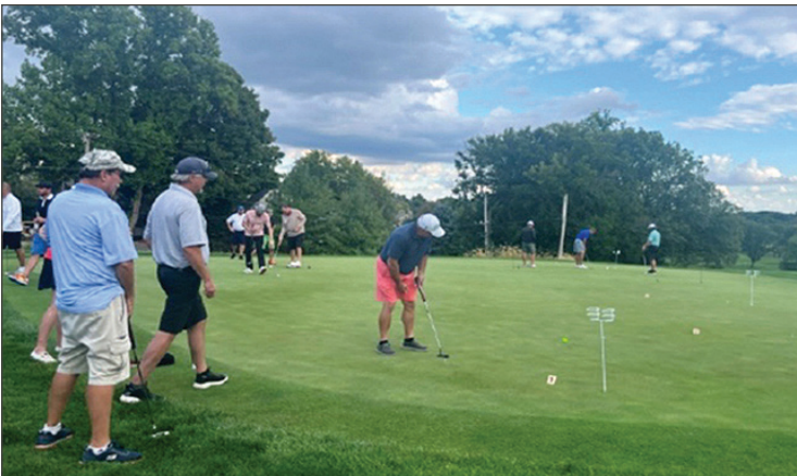
Participating in the putting contest was loads of fun.