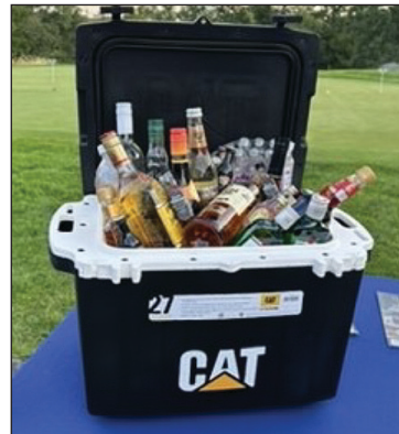
Sponsor Altorfer Cat provided a Booze Cooler for an exclusive raffle!