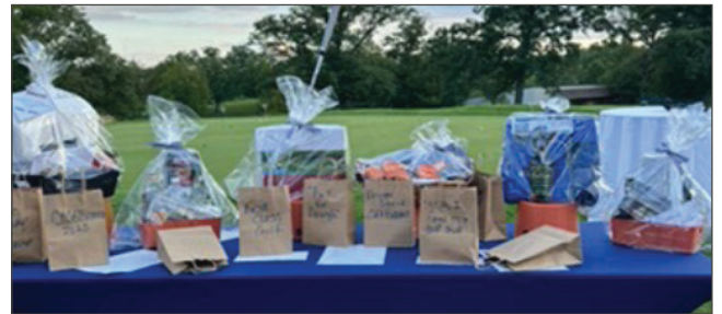
Raffle prizes galore!