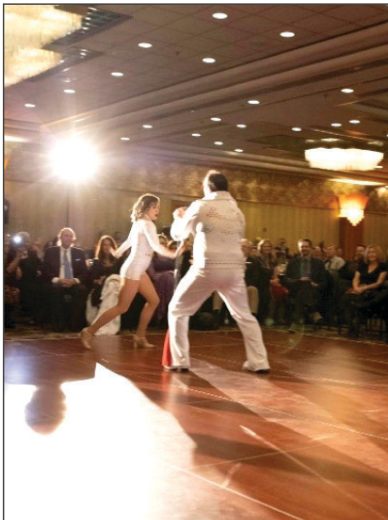
One of Our Dance Pairs Showing Their Skills

CASAblanca 2023 was wildly entertaining with remarkable talent. The dancing novices, along with their sage coaches/dance partners, swayed and bopped through several genres of dance, drawing a record number of tickets sold, and, without question, fun was had by all. Another win? As in every past year, CASA's mission was imparted to over 700 attendees: some who knew our mission well, some who learned of CASA for the first time, and everyone in between. A huge "thank you" to our sponsors and volunteers, CASA staff and Par-A-Dice's incredible team!