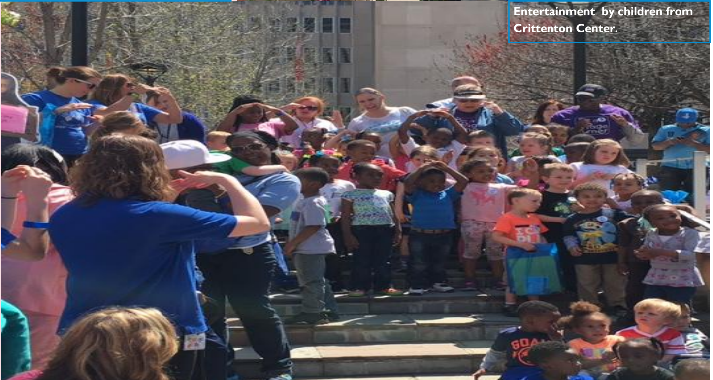
Entertainment by children from Crittenton Center.