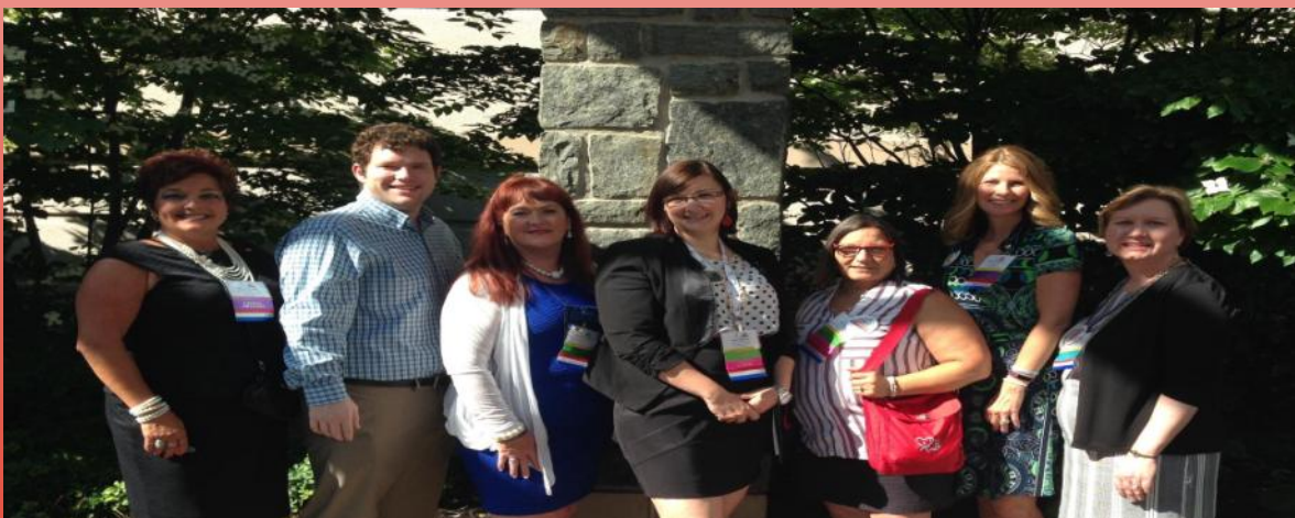
IL CASA team for "CASA Meets Congress" on Tuesday, June 7th, 2016.

The conference concluded with CASA Meets Congress . This day provided the opportunity for CASA/GAL supporters to make their voice heard on Capitol Hill and share the importance of the CASA mission with members of congress. Participants scheduled personal meetings with Congressional offices to spread the word about all of the great things CASA does and the needs of the program.